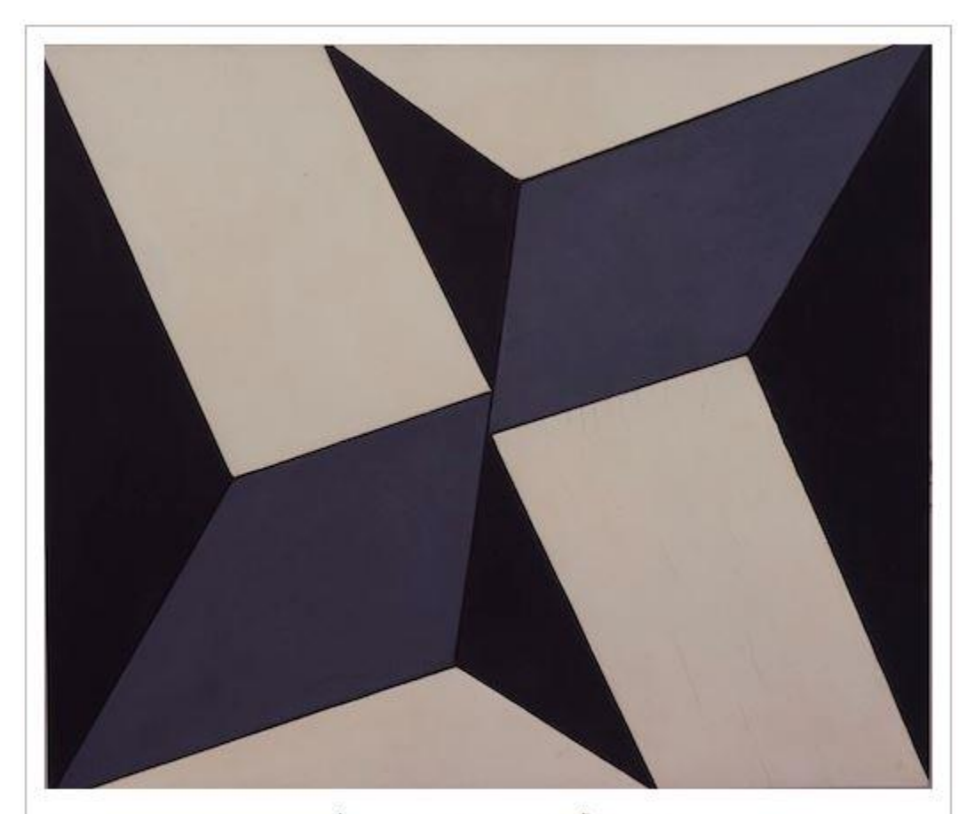
Lygia Clark, Planos em superficie modulada no. 2, versão 01 (Planes in modulated surface no. 2, version 1), ca. 1957, industrial paint on wood.

LUIZ PAULO MONTENEGRO COLLECTION.