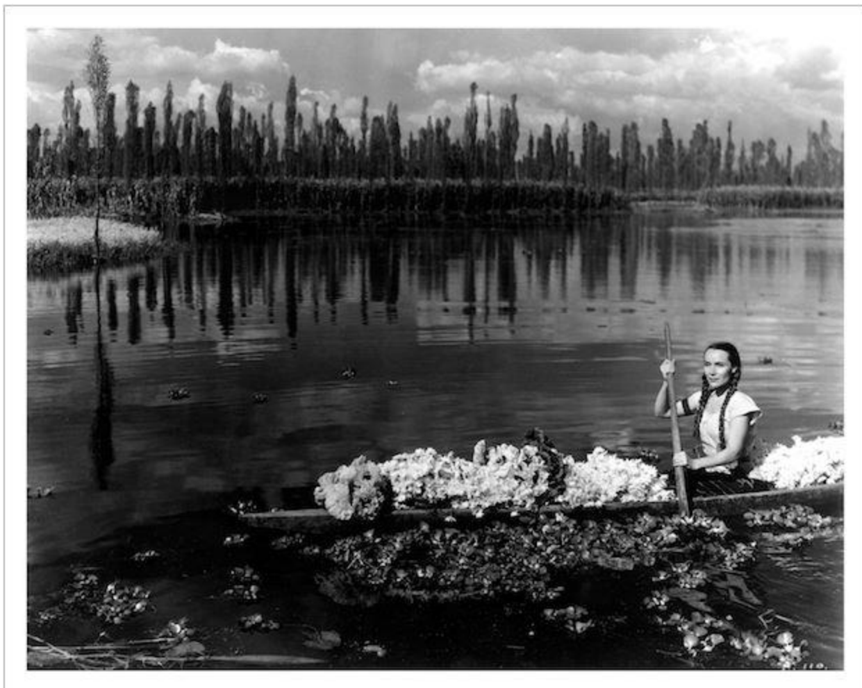
Gabriel Figueroa, still from María Candelaria, directed by Emilio "El Indio" Fernández, 1943.